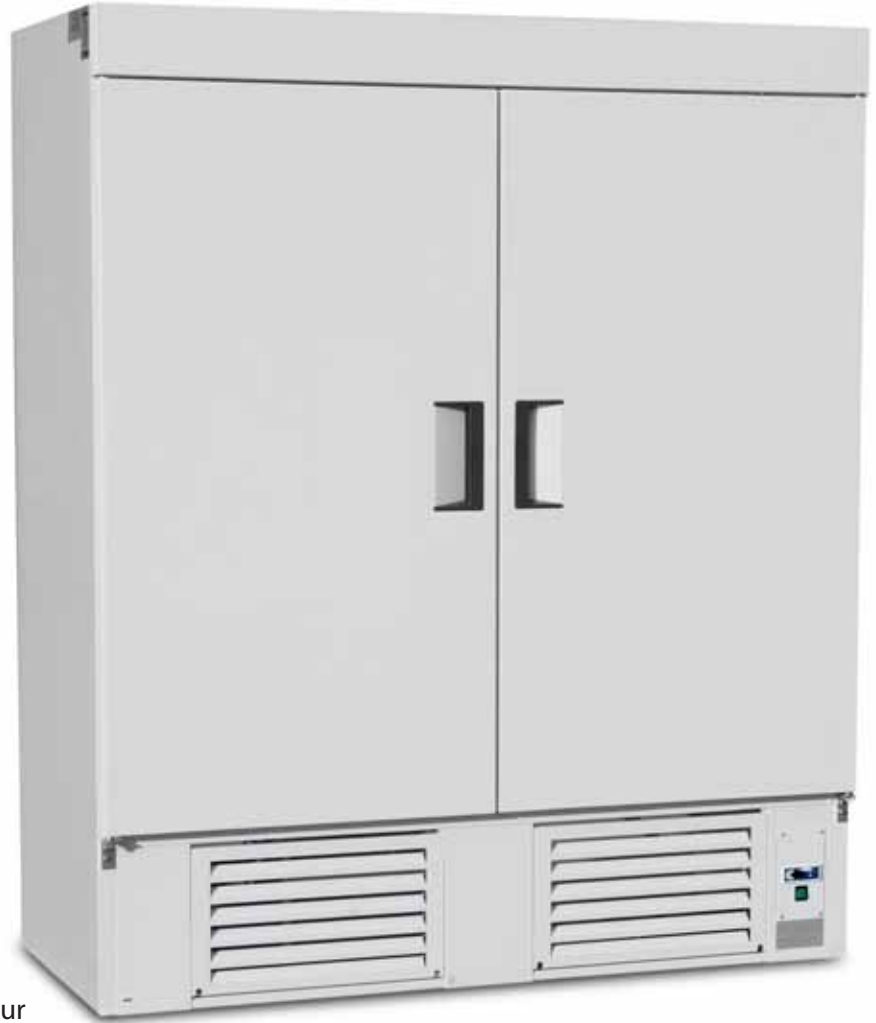
I-Ola P M*